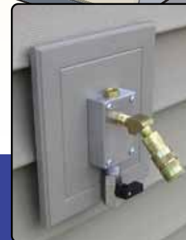
Exterior Mount Air outlet is mounted outdoors