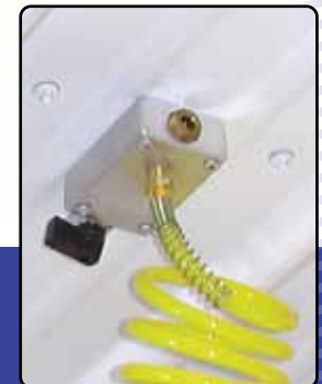
Ceiling Mount Air outlet is mounted on ceiling