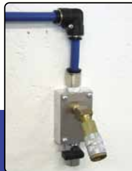
Surface Mount Air line is mounted to wall