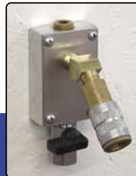
Hidden Mount Air line is inside wall